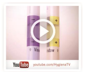
Watch an instructional demo at youtube.com/HygienaTV

InSite Salmonella is a quick and easy test for the detection of Salmonella species in food processing environments. The test contains a liquid medium formulated with growth enhancers and chromogenic compounds selective for Salmonella species. A color change from purple to bright yellow in 24 – 48 hours is presumptive positive for Salmonella species. InSite Salmonella is a self-contained screening test which is easy to perform while reducing wait time, labor costs, and materials.