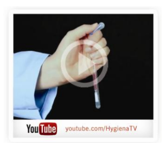
Watch an instructional demo at youtube.com/HygienaTV